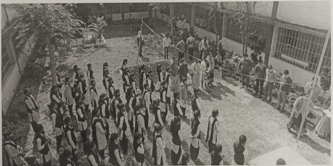
Celebration of Independence Day & Republic Day

[Handwritten Signature] PRINCIPAL Raja Bhoj Govt. College Katangi-Balaghat- M.P